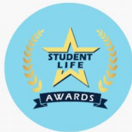
Haunted HEEP Walk